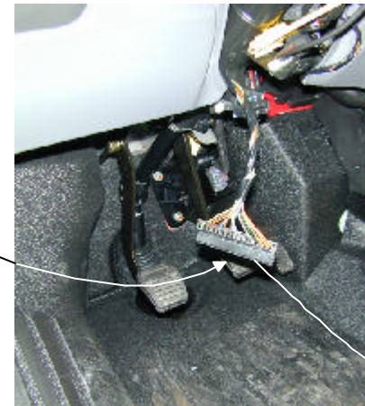
CONNECTOR LOCATED BEHIND INSTRUMENT CLUSTER